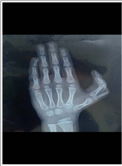
Figure 2: Showing Radiologic Evidence of Polydactyly