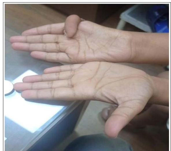
Figure 5: Showing Malformation of Hands

An 8 year old non-consanguineous male child, mainly asymptomatic apart from mild persistent abdominal pain presented with his abdominal ultrasonography revealing non visualised right kidney in right renal fossa or any other ectopic location and a normal appearing left kidney with the bipolar measurement of 9.8 cm. The abdominal examination was consistent with the ultrasonographic findings as no renal mass could be palpated on bimanual palpation on the right side. However, the left kidney was normally palpated. His general physical examination revealed few hypopigmented macular areas on his face and neck. His skeletal survey showed congenital malformations of hands and feet. Deformed hands and feet were noticed right after birth but no major illnesses were reported till 4 years of age. Thereafter, he appeared to be lethargic and pale. His IQ is however normal for his age. Thorough history taking revealed right undescended testis that had been surgically corrected at 2 years of age. There were no similar renal or skeletal abnormalities in his family. His visual acuity and fundus examination was normal. His investigations showed Hemoglobin of 9.2 g/dl, WBC count of 7800/mm creatinine of 1.9 mg/dl, urea of 54 mg/dl, sodium 138 meq/l, potassium of 4.0 meq/l. His echocardiogram was normal. He is currently being managed symptomatically with a close follow up of renal function tests.