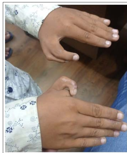
Figure 1: Showing Polydactyly

completely descended normal appearing testis. Skeletal survey showed congenital reduction deformities of both feet. Abdominal ultrasonography revealed bilaterally small kidneys with altered CMD. The bipolar measurement of right kidney was 4.5cm and left kidney as 4.3cm. There was no similar history in his family. On investigation, Haemoglobin was 9 gm/dl, TC of WBC was 13000/mm, platelet count 160000/mm [3]. Serum creatinine was 3 mg/dl, sodium was 134 mEq/L, potassium was 4.8 mEq/L. His visual acuity and fundus examination was reported to be normal. His echocardiography revealed no significant heart anomalies. He was managed on the lines of chronic kidney disease and is being followed up with renal function tests periodically.