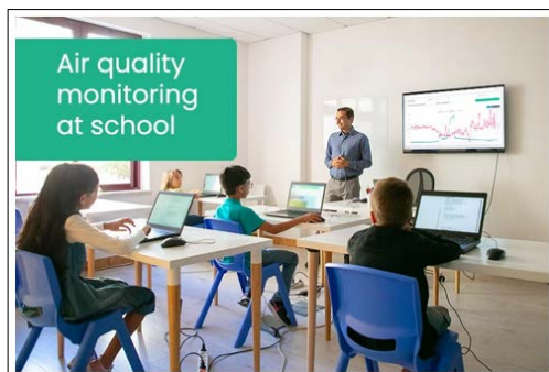
Figure 2: Improving Indoor Air Quality in Schools with Air Quality Monitoring: Introducing HibouAir | By HibouAir