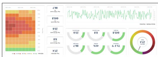
Figure 3: Improving Indoor Air Quality in Schools with Air Quality Monitoring: Introducing HibouAir | By HibouAir