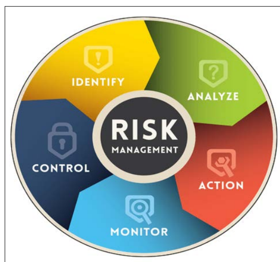
Figure 3: RM Function [26]

The need to manage and prevent financial risks has increased in the past decade because of factors including increasing macroeconomic pressure, market competitiveness, criminal activity, and more regulatory demands. Commercial banks are risk managers and risk takers in their ability as financial intermediates mostly. The financial business landscape is getting more risky and complex as financial systems have become more difficult and speed in world financial integration. All the FI, including the bank's capability to attain competitive advantages in developing environments, is based on their capability to control and prevent risk intelligently [24]. Advanced technologies help banks and other FI get real data on their own and client's assets, enhancing the algorithm's effectiveness for validating financial risks [25].