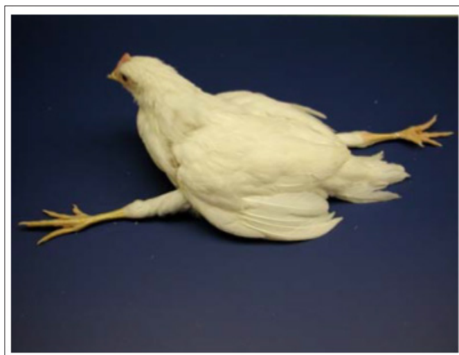
Figure 2. Paralyzed chicken with huddled stance (Splay-leg posture of chicken with sciatic neuropathy).

Birds between 12 and 24 weeks of age are most commonly affected. Clinically, Marek's disease presents as partial or complete paralysis of legs and wings [38]. A particularly characteristic posture is that in which the bird has one leg stretched forward and the other backward as a result of partial or complete paralysis of the leg (figure 2). Sometimes, when the cervical nerves are involved, there may be torticollis (twisting of the neck to one side); and if the vagus and intercostals nerves are affected, respiratory symptoms may develop. The interval between onset of symptoms and death varies from a few days to several weeks [9].